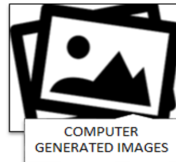
COMPUTER GENERATED IMAGES